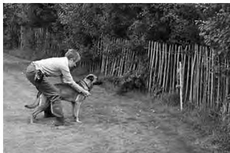
fig 1 the ‘gate’

when there is no pole or reward out there. If you remember, we got to the stage that we could peg the ‘ball-on-rope’ to the pole, drag him away and release him to run away from you to get the toy on the command, “Get-it.” (Or if he was not interested in a ball we used food in a ladle.) Here comes the tricky bit: holding on to his collar straddle him and verbally wind him up to look at his reward on the pole, release him to ‘get-it’ when he is straining to get to it. I call this part of my set-up, ‘the gate.’ I find that holding the dog back whilst encouraging him to get the reward increased the drive to get to it, just like horses and greyhounds are restrained in a gate at the beginning of a race.