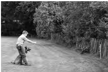
fig 2 Sit

Next we need to introduce an element of control without dampening his enthusiasm. I want him to sit on command before allowing him to go. (Note I said ‘allowing him to go,’ not sending or making – but allowing!)