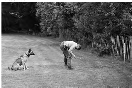
Fig 3 sit wait before gate – pole in sight

Next we need to teach him to sit and wait, while you walk the line (setting the direction) and then call him up into the gate, before sending him on to the pole to get his reward.