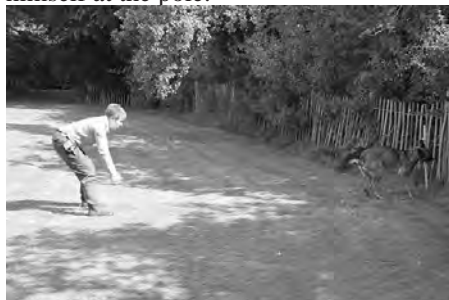
Fig 4 dog self rewarding

Now you are ready to begin training your sendaway complete with the set-up. Hang your reward on the pole as usual and take your dog a short way from it (he will probably not need to be dragged now he is beginning to get the idea). Turn to face the pole and ask him to sit beside you (on your left). Take a few steps towards the pole, and then make the gate by stepping aside with your left leg (you will then be directly in the path of your dog as he moves forward towards the pole). Call your dog into the gate, hold him back, and encourage him to strain towards the pole. Give his ‘get-it’ command and allow him to go and reward himself at the pole.